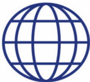
Caleb Greenwood Website