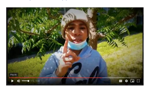
Click on the Fund-A-Need Website Below to Support Student Action!